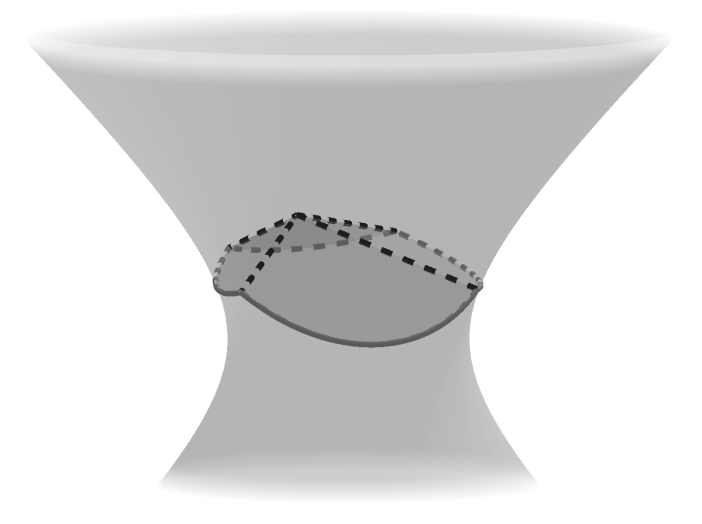
Figure 3: A hipped hypersurface in \mathbb{A}d\mathbb{S}^3 .